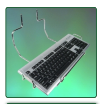
Keyboard holder for long medical arms