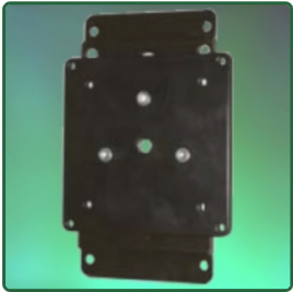
VESA Mini UC Holder for Medical Arm Combo H Class INTOP Wall Mounting Part Number: 116.004